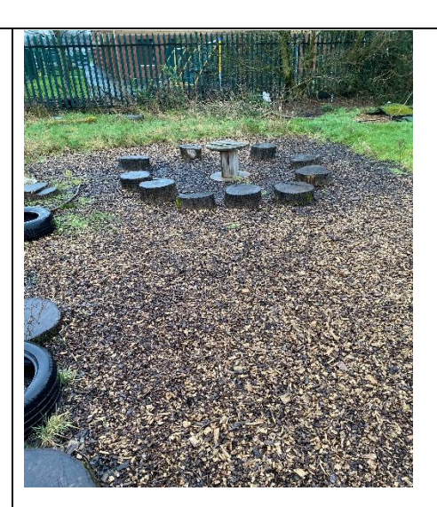
This would be the position of the outdoor classroom.