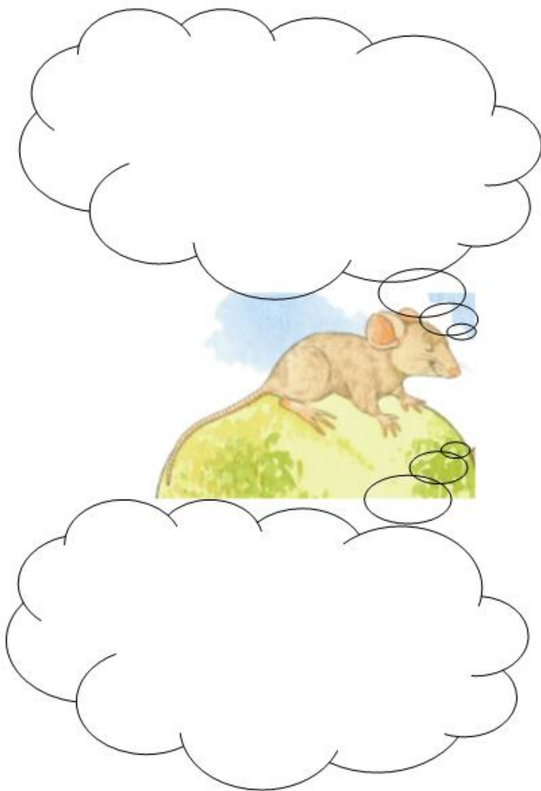
Resource Sheet 1 –Proud and Boastful